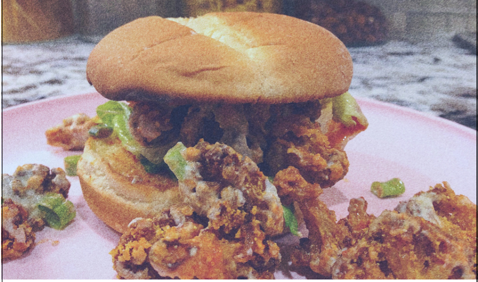
FRENCHIE'S CRISPY BUFFALO CAULIFLOWER SANDWICH (V)

Each order helps support our mission to provide free meals to families and communities in food deserts. We appreciate the support.